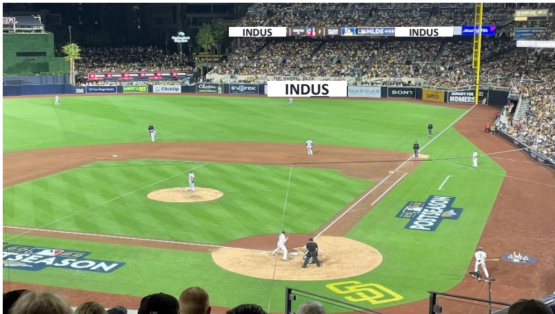
San Diego Padres Community Sponsor