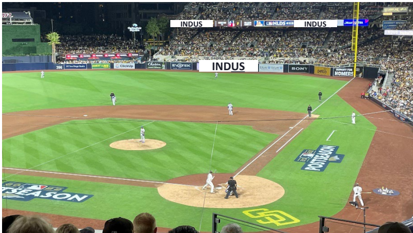
San Diego Padres Community Sponsor